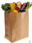
1. Do you know what's in your groceries?