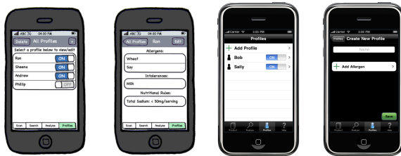
Before and after: original mock-ups (left) and their final prototype counterparts (right).