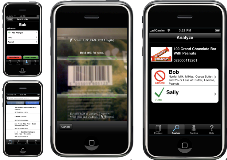
3. Moving counter-clockwise: You can create a profile, search for a product, or scan its barcode, and find out if that product is safe to eat for each profile.

Our final prototype is a tab-based application with 4 tabs: Product, Analyze, Profiles, and Help. It includes an integrated barcode scanner, powered by RedLaser, that utilizes the iPhone's camera to accurately capture and process barcodes. It also sports an integrated database of over 60,000 products and a remarkably simple, yet effective, profile management system, which gives users the ability to add and delete profiles, allergens, and even define custom allergens.