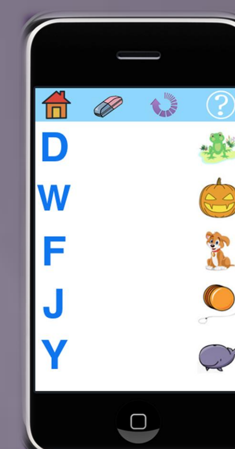
Here we can see the Words View and the Matching Game.