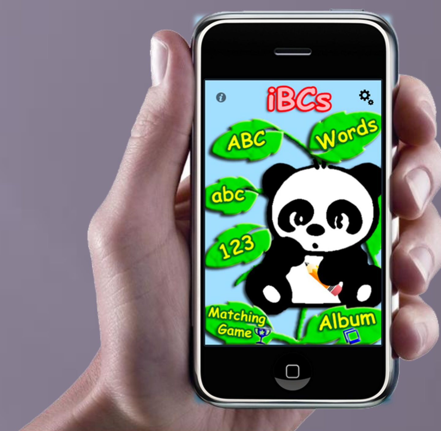
Here we see a user using the iBCs application home page.

Our application targets both parents and their preschool-aged children ranging from three to five years old. Children within this age range are just beginning to learn letter/word comprehension and will benefit the most from our application. For the parents, time is a valuable asset when their child is in their prime-learning phase so making good use of every minute is key to maximizing their child's learning opportunity.