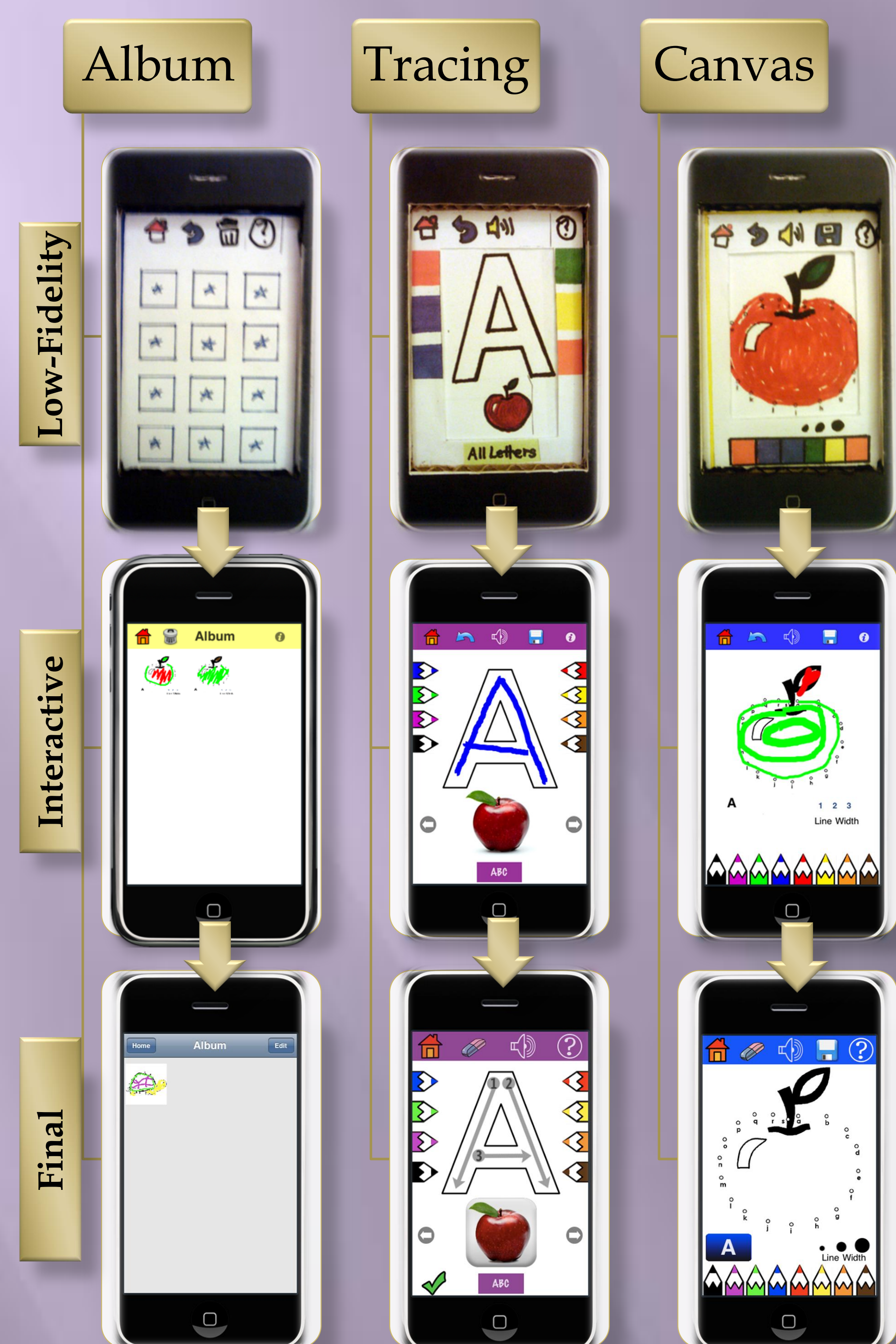
Here is a table showing the three tasks during the three design iterations.

Many design enhancements went into our final prototype. From icon selection to coordinating color schemes, the final prototype was revamped with visual prompts that increases affordance and color activities that help retain our user's attention.